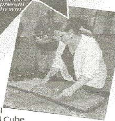
Live hands-on demonstrations!